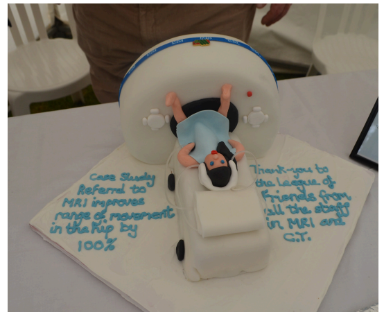
"Thank You" Cake from MRI & CT