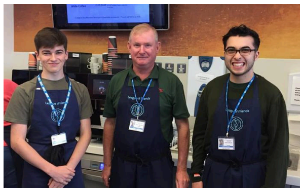
Some of our Coffee Shop volunteers

Updates, events, and more. . CELEBRATING OUR FUNDRAISERS & VOLUNTEERS