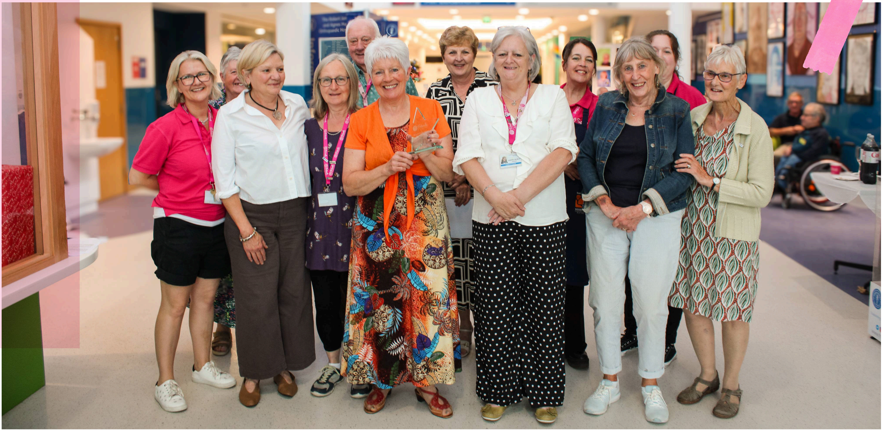
Volunteer Team of the Year: Coffee Shop